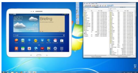
Tablet viewed remotely from Windows desktop Simultaneous split-screen file transfer

PC – Mac – Tablet – Smartphone – Embedded device