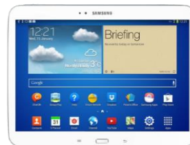
Your device anywhere